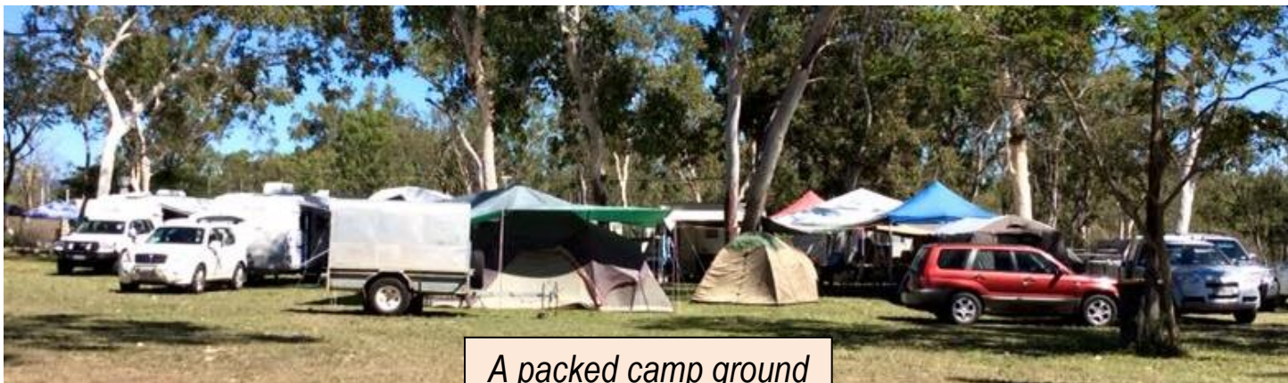
A packed camp ground