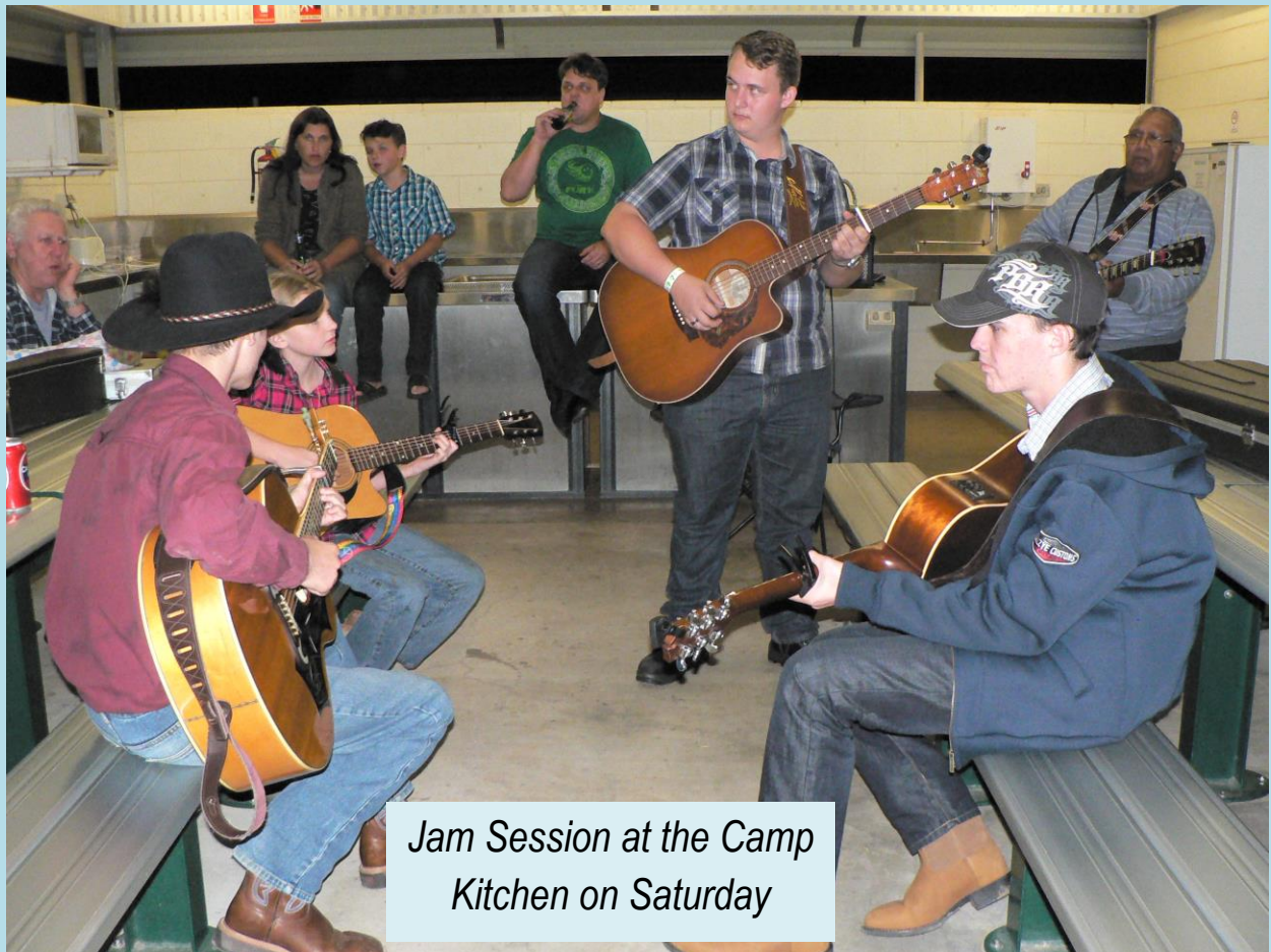
Jam Session at the Camp Kitchen on Saturday