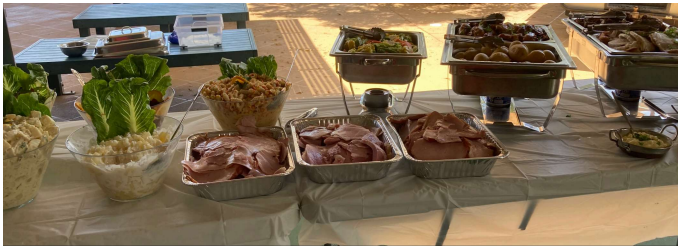
Wonderful feast from Golden Roast