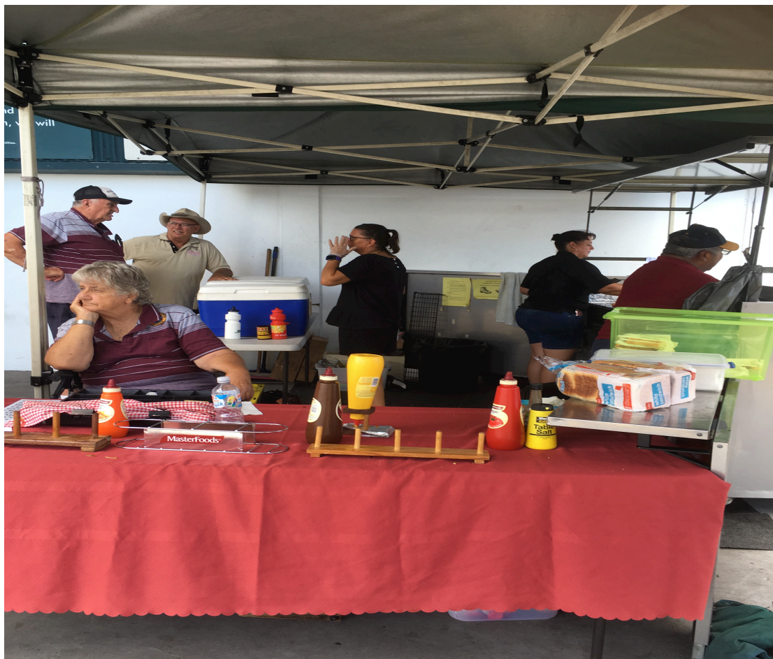
A short reprieve