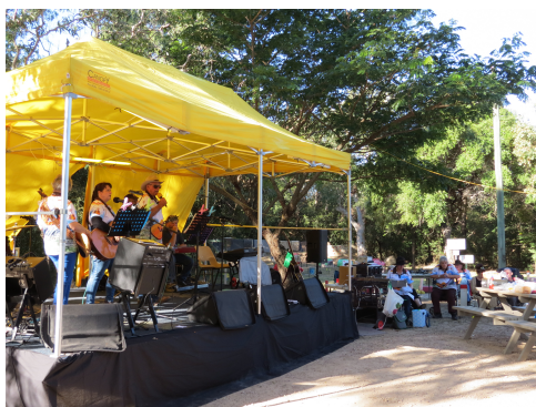
Singing up a storm