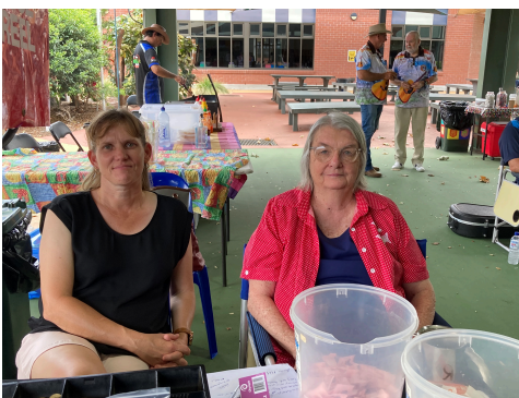
ur wonderful ladies working hard at the welcome desk